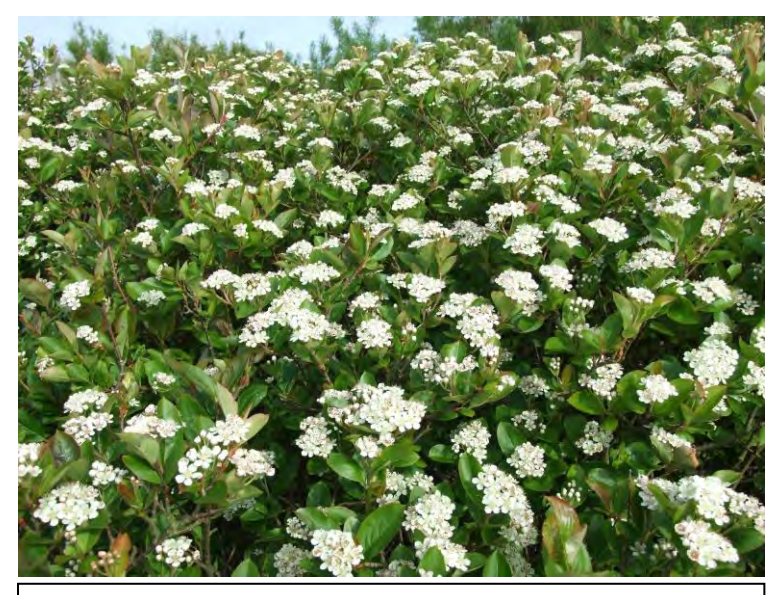
Prolific flowering of aronia in June 2018 resulted in an excellent crop of fruit in September, with production exceeding 4 kg per bush.

alnifolia), low-bush blueberries (Vaccinium angustifolium), salal (Gaultheria shallon) and elder (Sambucus nigra).