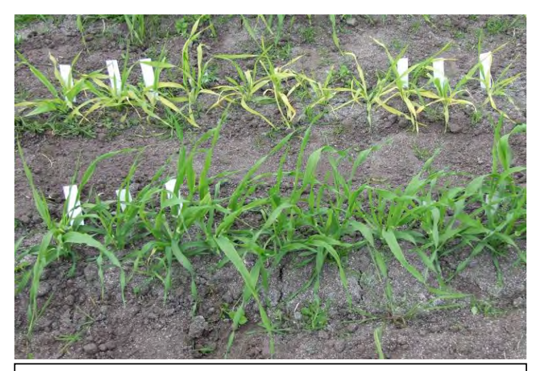
Barley growing in a trial on a sandy soil in Orkney during 2018. The top row is a modern variety and shows serious manganese deficiency. The Bere plants in the bottom row have a tolerance to soils deficient in trace elements and are progeny of seed originally collected from Unst in Shetland.

reliance and to facilitate the development of new markets. It built on the collaboration and experience developed by the partners in an earlier NORA-funded cereal project.