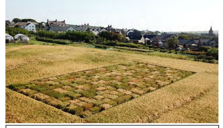
Trial of heritage and modern barley accessions at Orkney College in late July 2018. Most of the plots which are still green are modern varieties while many of those which have lost their colour are early maturing accessions of Bere.

This project started in 2016 and is funded through the Scottish Government's Rural and Environmental Science and Analytical Services (RESAS) Division. As part of a wider research programme supported by RESAS on Biodiversity and Ecosystem Function, the Institute is collaborating with researchers at the James Hutton Institute (JHI) to investigate genetic diversity and local adaptation in Scottish barley