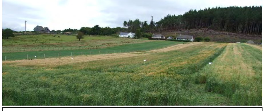
Barley variety trial on Raasay testing four early maturing varieties. The earliest variety (far left fully senesced strip) was Iskria from Iceland.

Under this theme, the Institute is investigating both modern and heritage cereal varieties which are early-maturing and therefore suited to growing in the Highlands and Islands' short, cool growing season. They are mainly being considered for food and drink products and include varieties of barley, wheat and oats. Early-maturing varieties from Northern Europe are thought to be very suitable for the north of