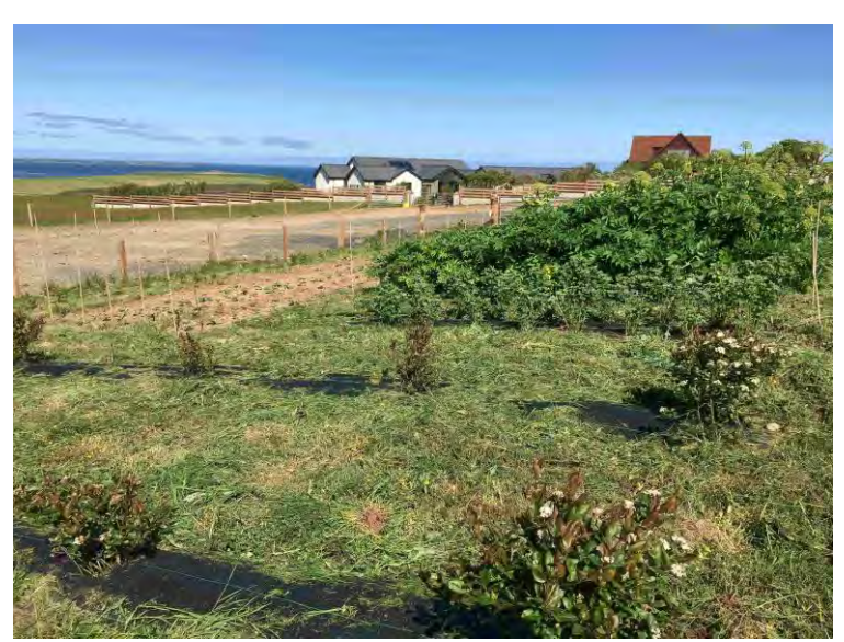
Botanicals garden established for Orkney Distilling Ltd by the Agronomy Institute. Plants in the foreground and background are aronia and angelica, respectively.

As a research centre within UHI, it is particularly appropriate that the benefits of AI activities are spread over the Highlands and Islands. In addition to the Institute's strong Orkney links, recent collaborations with commercial organisations in Shetland (Shetland Livestock Marketing Group and Valhalla Brewery), Islay (Bruichladdich Distillery), Arran (Isle of Arran Distillers) and Raasay (R&B Distillers Ltd) demonstrate that the Institute's activities impact on diverse parts of the region. Collaborations between the AI and other research centres (e.g. the James Hutton Institute, the Rowett Institute and Forestry Commission Scotland) help these organisations deliver research projects benefiting remoter parts of the Highlands and Islands.