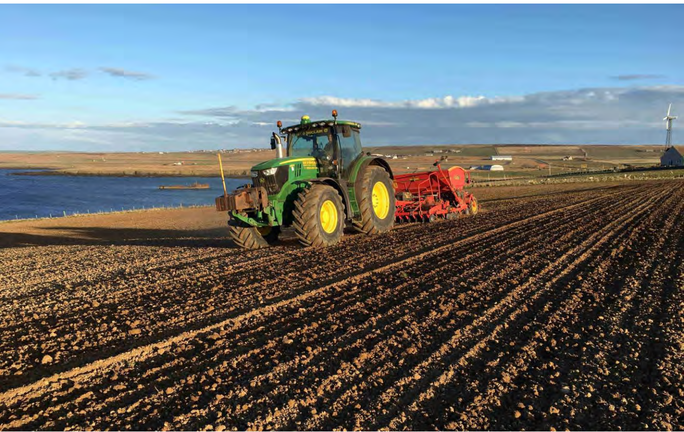
Sowing Bere on Orkney at Inganess Farm In April 2018

Agronomy Institute, Orkney College UHI, Kirkwall, Orkney, KW15 1LX. www.agronomy.uhi.ac.uk