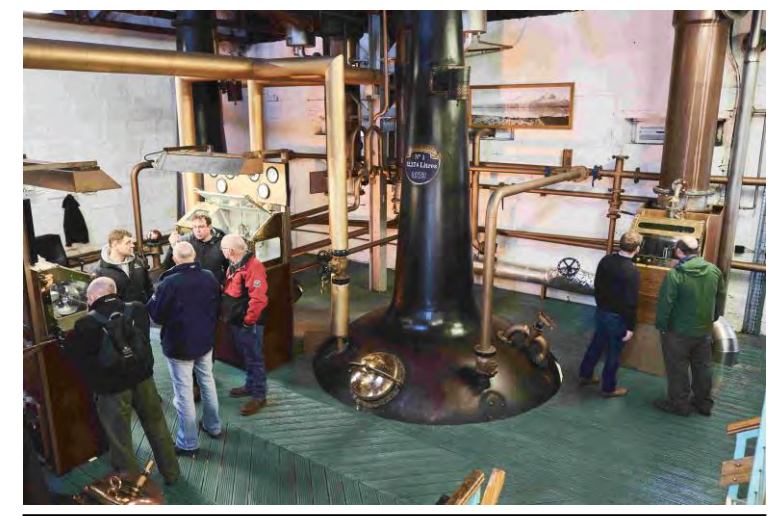
Knowledge exchange visit by Orkney Bere stakeholders to Bruichladdich Distillery in January 2019 to see the distillation of spirit made from the 2018 Orkney crop.

Research Organisations: Agricultural Centre (Faroe Islands); Agricultural University of Iceland; Forestry and Agrifoods Agency (Government of Newfoundland & Labrador, Canada); Forestry Commission Scotland; LUKE (Natural Resources Institute Finland); MATIS (Icelandic Food and Biotech R&D); NIAB (National Institute of Agricultural Botany); NIBIO (Norwegian Institute of Bioeconomy Research); The James