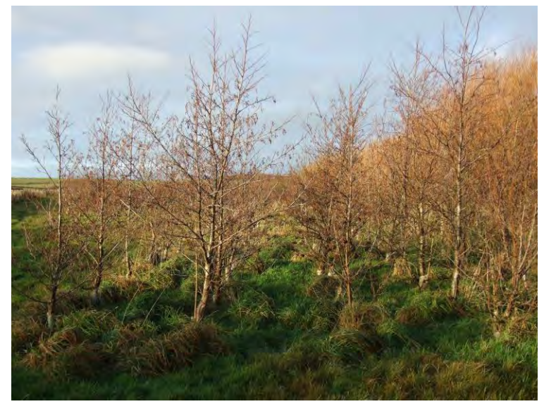
Trees of common alder in December 2018 at the Muddisdale short rotation forestry trial. This is one of the best performing species in the trial and by the end of its sixth growing season had reached an average height of 3.2 m.

Since 2011, the AI has been collaborating with Forestry Commission Scotland and Orkney stakeholders to investigate the potential for short rotation forestry (SRF) in Orkney. For SRF, trees are planted at a closer spacing (c. 2,000-3,000 trees/ha) than for normal forestry. Fast growing species are used, with the objective of harvesting them at about 15-20 years. Several of these species can be coppiced and should therefore regenerate after harvesting. SRF systems are considered particularly suitable for the establishment of small areas of woodland on farms, where the wood could have a number of end-uses, including firewood. A major advantage of SRF for small-scale growers in remote areas