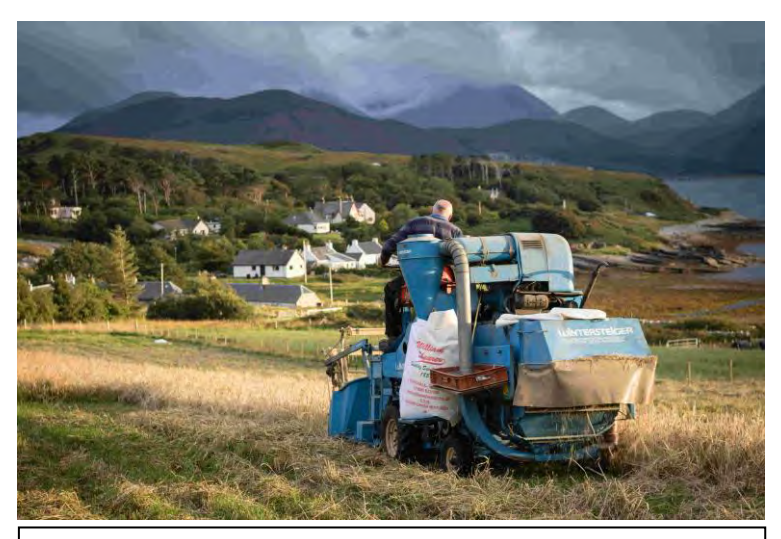
Billy Scott harvesting barley from the variety trial on Raasay in September 2018.

Raasay and Borders (R&B) Distillers opened a new distillery on the Hebridean island of Raasay, near Skye, in September 2017. The company is keen to source some of the barley used by the distillery locally but, since the crop has not been grown there for a long time, it approached the Institute to help it investigate the feasibility of doing this. One of the main challenges identified is very high rainfall around harvest time, and records suggest that conditions in August are likely to be more favourable than in September. On-farm variety trials in 2017 and 2018, therefore included early-maturing varieties from northern Europe and these were successfully harvested in both years. Grain from the 2017 crop was malted and distilled at Raasay Distillery in August 2018, and testing is continuing in 2019. This research has been supported by assistance from the James Hutton Institute.